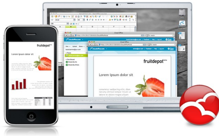
Figure 1: Edit, publish and share documents via web or mobile – collaboration made easy.

The internet radically changed the information services on which the globalized world increasingly relies. Oracle Cloud Office is designed to address the needs of the knowledge worker in this context delivering the web service approach to office productivity - easy to use via browser, open for Web 2.0 style collaboration and with enterprise on-premise deployment.